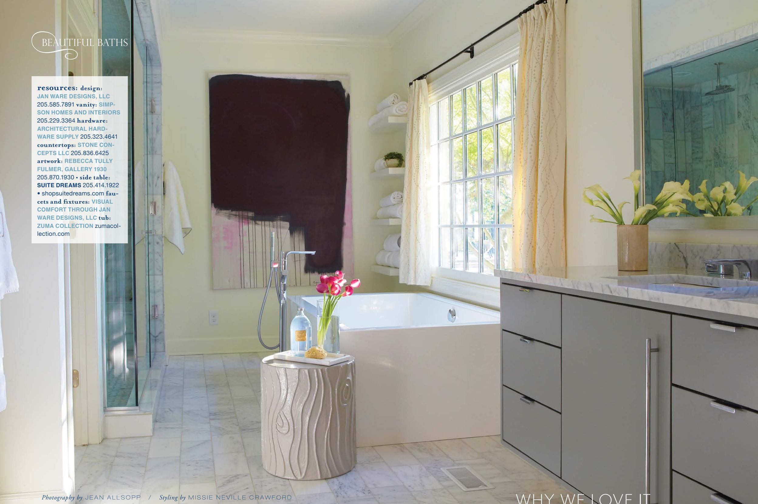
Styling by MISSIE NEVILLE CRAWFORD

resources: design: JAN WARE DESIGNS, LLC 205.585.7891 vanity: SIMP- SON HOMES AND INTERIORS 205.229.3364 hardware: ARCHITECTURAL HARD- WARE SUPPLY 205.323.4641 countertops: STONE CON- CEPTS LLC 205.836.6425 artwork: REBECCA TULLY FULMER, GALLERY 1930 205.870.1930 • side table: SUITE DREAMS 205.414.1922 • shopsuitedreams.com faucets and fixtures: VISUAL COMFORT THROUGH JAN WARE DESIGNS, LLC tub: ZUMA COLLECTION zumacol- lection.com